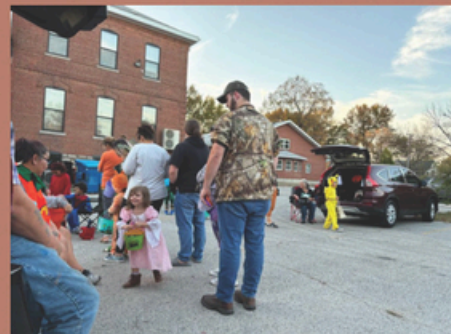
Our Trunk or Treat welcomed over 100 kids on October 29th!